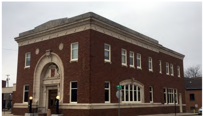
Horicon State Bank, Horicon