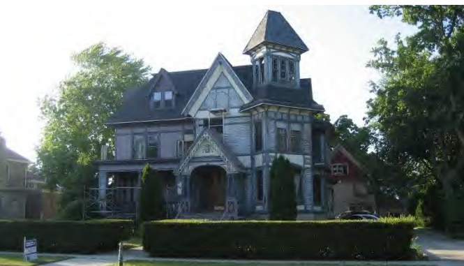
East Division Street-Sheboygan Street Historic District, Fond du Lac