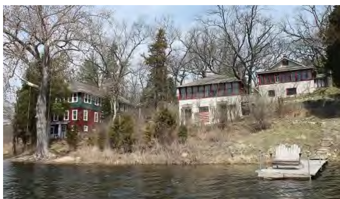
Wandawega Inn, Sugar Creek