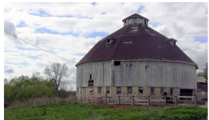
Rudolph Lueder 13-Sided Barn, Plymouth