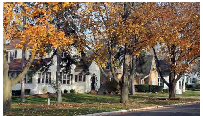
Miramar Drive Residential Historic District, Allouez