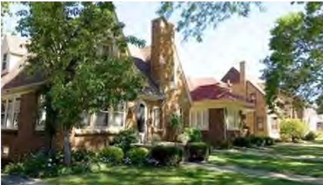
Melvin Avenue Residential Historic District, Racine