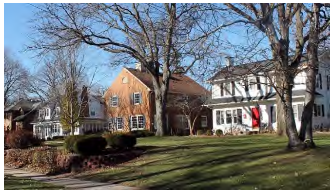
Milwaukee - Emerson Residential Historic District, Beloit