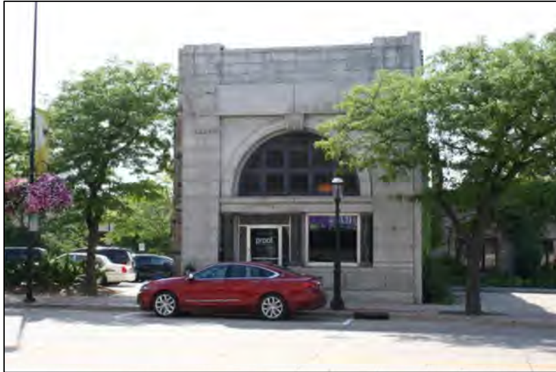
State Bank of De Pere, 127 N. Broadway (AHI 1801)

topographic map with UTM coordinates and a historic boundary map showing locations of contributing and noncontributing resources). The fieldwork phase of the project will be followed by detailed historical research relating to the history and development of the property and its significance within appropriate historic and architectural contexts. Archival research will be followed by the preparation of the narrative portions of the nominations as well as the assembly of supplemental documents required by the Wisconsin SHPO. The property's Wisconsin Historic Preservation Database record will be updated as well.