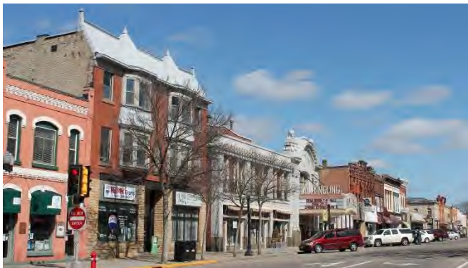
Downtown Baraboo Historic District, Baraboo