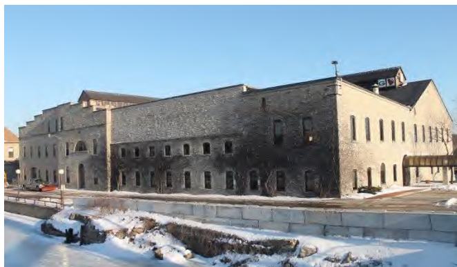
Eagle Paper & Flouring Mill, Kaukauna