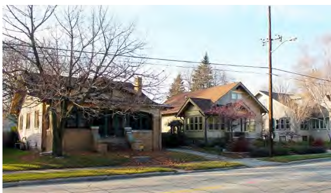
North Main Street Bungalow Historic District, Oshkosh