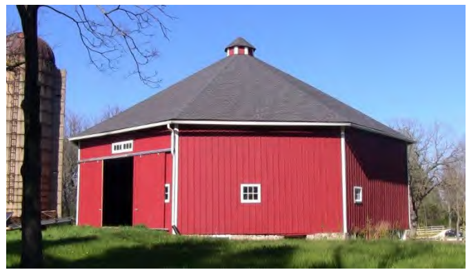
Frank Vocke Octagonal Barn, Mequon