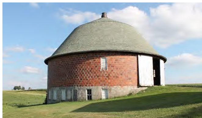
Bert & Mary Cunningham Round Barn, Viroqua