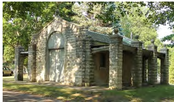
Burlington Cemetery Chapel, Burlington