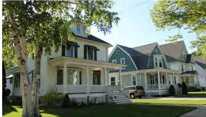
Richards Hill Residential Historic District, Watertown