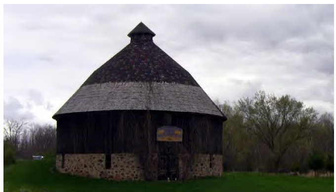
John Lindstrom Round Barn, Balsam Lake