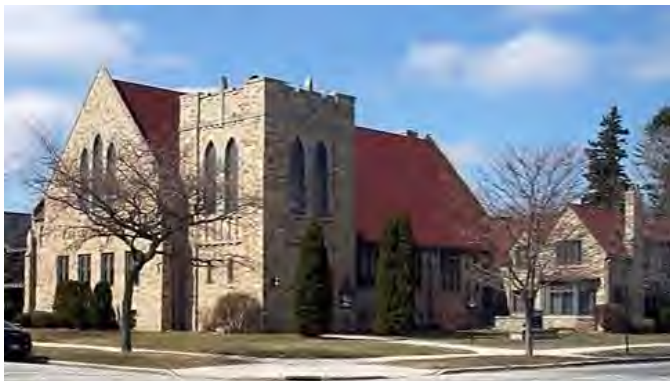
Downtown Churches Historic District, Sheboygan