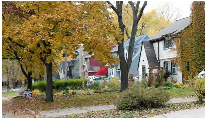
Robinson Hill Residential Historic District, Allouez