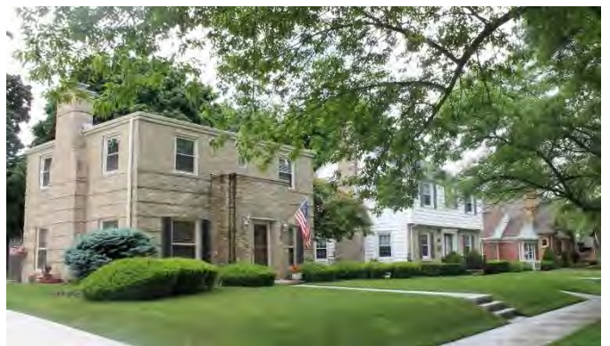
Orchard Street Residential Historic District, Racine