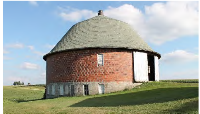
Bert & Mary Cunningham Round Barn, Viroqua

Not a nomination in its own right, our documentation will serve as the basis for evaluating National Register eligibility and establish registration requirements for centric barns to be nominated in the future. To date, this project has spurred the nomination of 7 Centric Barns in the state.