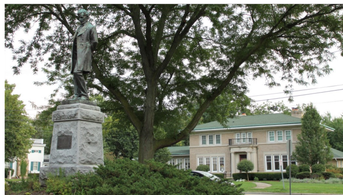
Kane Street Historic District, Burlington