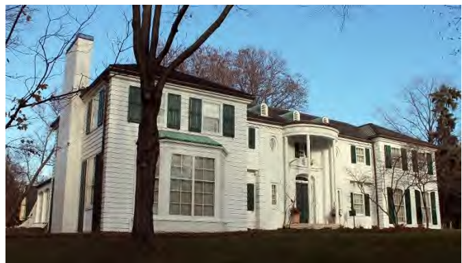
Albert C. Neufeld House, Allouez