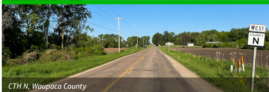
CTH N, Waupaca County